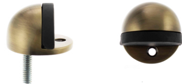
Product Finish Pictured: Antique Brass