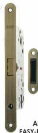
Antique Brass (AB) EASY-FIX Strike Plate Pictured