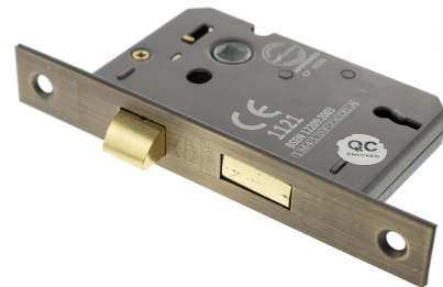
Product Finish Pictured: Matt Antique Brass (MAB)