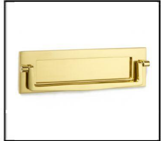
Postal Knocker 1643

Dimensions: Other sizes available are below: