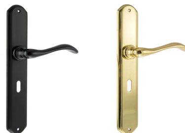
Product Finish Pictured: Matt Black & Polished Brass